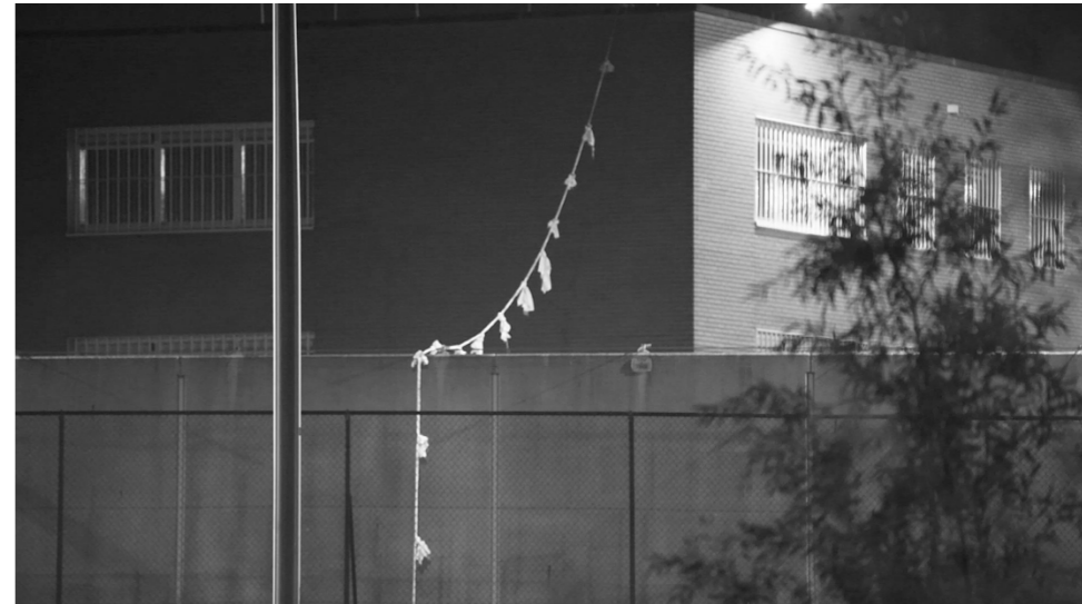
Alphen, October 2022

dress. In the days since these details were revealed publicly, mass demonstrations have broken out across Iran decrying Mahsa's murder at the hands of the police. The flames of the uprising have set 29 out of 31 provinces of Iran on fire. The protests are still going. The police cars are being flipped. The police stations were scaled and burned down. Many people lost their lives through brutal police violence. Even though the internet was massively disturbed by the state, the uprising continues.