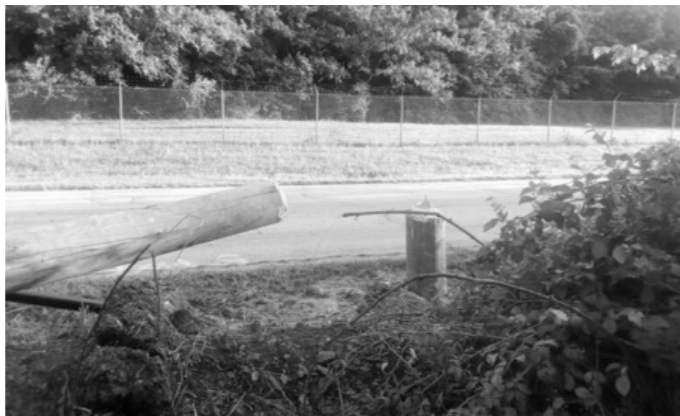
Atlanta forest, United States, 2022

state television studios, as the political and economic crisis appeared to be moving towards a climax. The anger came to a boil earlier this month when tens of thousands of people hit the streets in Colombo. Protesters burned down the homes of a number of politicians.