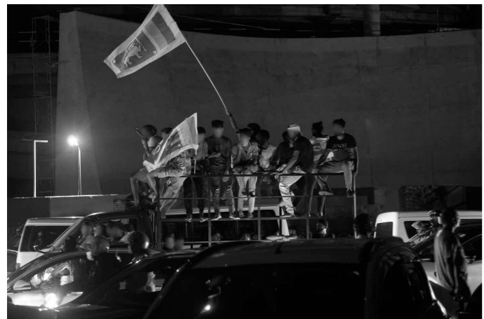
Sri Lanka, 2022

Next time it will be stone walls again, brick by brick. Some Angry Cunts