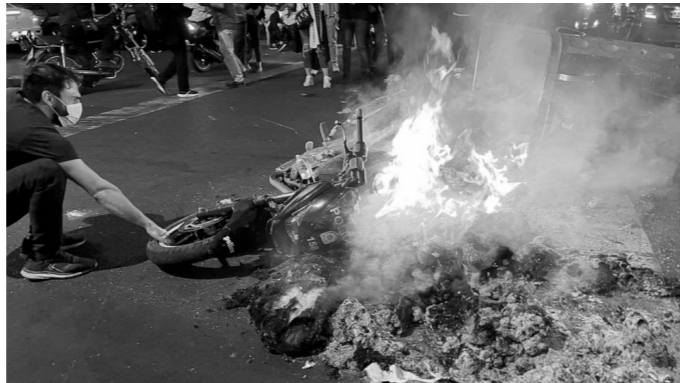
Iran, October 2022

Undercover cops started arresting people for several reasons: putting up stickers, public use of drugs, and a clown saying: 'hey, colleagues'. At one of the arrests the cops met resistance and they were attacked with pushing, pulling, hitting and cans of beer. An undercover cop van was blocked by people and pallets, also the air was let out of the tires.