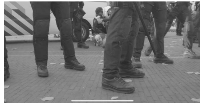
Amsterdam, October 2022

The fire was on about 15 meters high. Its the 2nd time in a year that the tower is on fire. The cops think that both times it was set on fire. The tower got severely damaged.